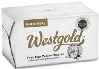
Westgold 454g Salted