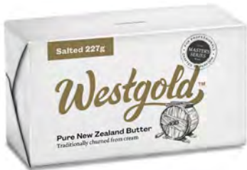
Westgold 227g Salted

Westgold butter is traditionally churned using the time-honoured Fritz Churn method to produce a creamier texture.