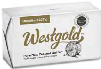
Westgold 227g Unsalted