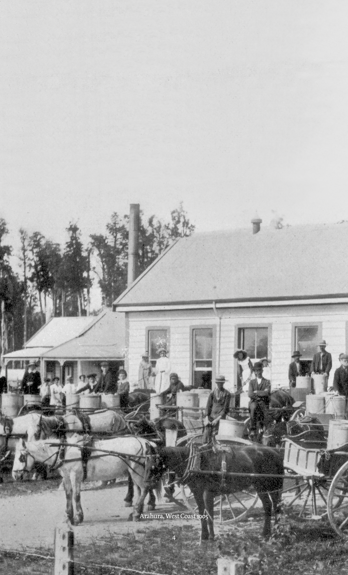
Arahura, West Coast 1905

We are proud of our past. The courageous decisions and pioneering spirit of previous generations have shaped our company into today's successful dairy processing business.