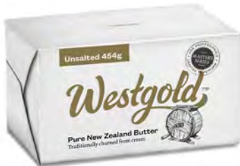
Westgold 454g Unsalted